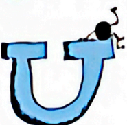
A Spot on U